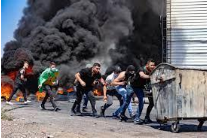
East Jerusalem, West Bank.